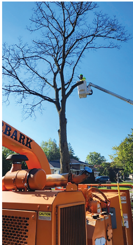
Highway crew trimming right-of-way trees after storm.

Springtime is also synonymous with home improvement projects. Residents residing in unincorporated Maine Township are under the jurisdiction of two local governments, Maine Township Highway Department and Cook County Building & Zoning Department (CCBZ). Please be advised that when submitting your request for Waiver Letter or Permit you will be required to provide your six-digit Cook