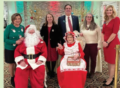
Holiday Party, Maine Township Elected Officials