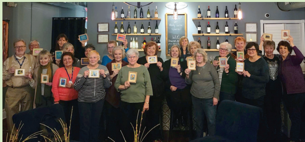
Uncork Unwind, Art & Sip, Des Plaines