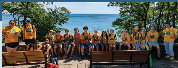
Our Adventure Maine Township Summer Camp participants enjoy a fun day at Glencoe Beach.

This community education presentation will provide a basic overview of special education eligibility in the school setting and