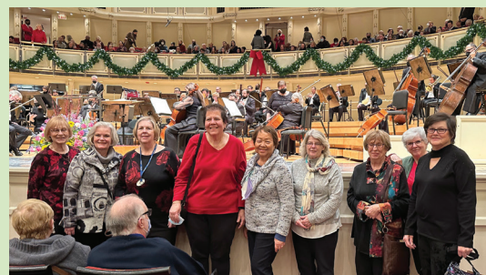
Salute To Vienna, Orchestra Hall