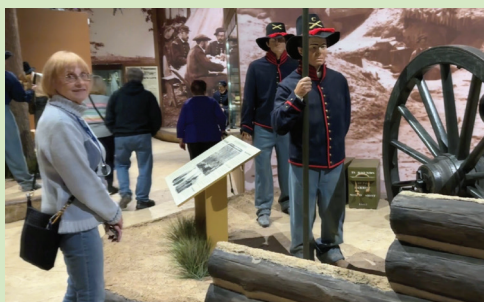
Kenosha Civil War Museum, Kenosha WI